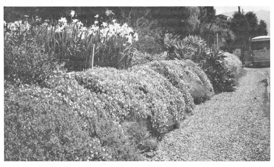
Spurias in bloom at Cordon Bleu Farms.