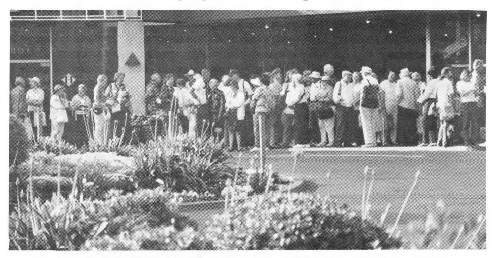
Irisarians at the Handlery Hotel preparing to board trek buses.

The San Diego/Imperial Counties Iris Society could, if they were so inclined, boast of a rich tradition of successful spring meetings including the national convention of the American Iris Society in 1975. It was obvious at checkin on Friday, April 24 that they retain that magic combination of graciousness and efficiency which makes their guests feel comfortable, at home.