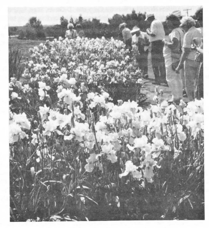
Iris trekkers take delight in a field of dreams.